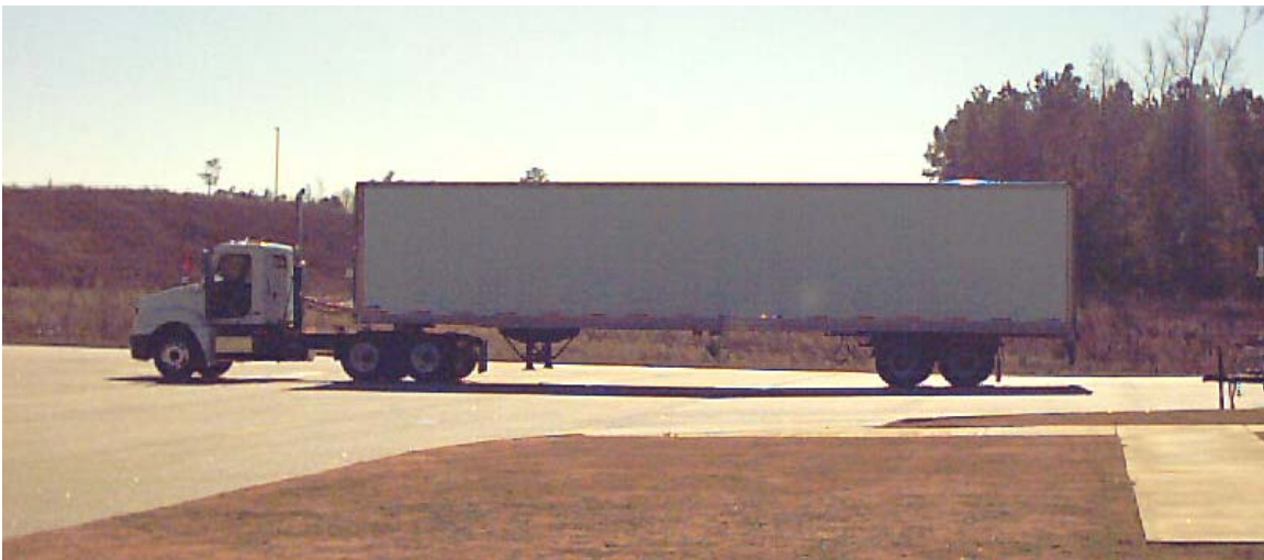
Figure 1 – Truck Configuration Used During the Testing Process

All fuel used was ultra low sulfur #2 diesel, verified by specific gravity at the time of testing. Any accessories that would have pulled auxiliary power were used in an identical manner in both tractors during all stages of Type II testing. Mirrors and windows were maintained in the same position for all stages of operation. Tire pressures were adjusted as necessary prior to the first test run on each day to ensure that all tires were within 5 psi of the manufacturers’ recommended cold inflation temperatures. Each tractor pulled standard cargo van trailers that were loaded to a GVW of 76,500 Lbs.