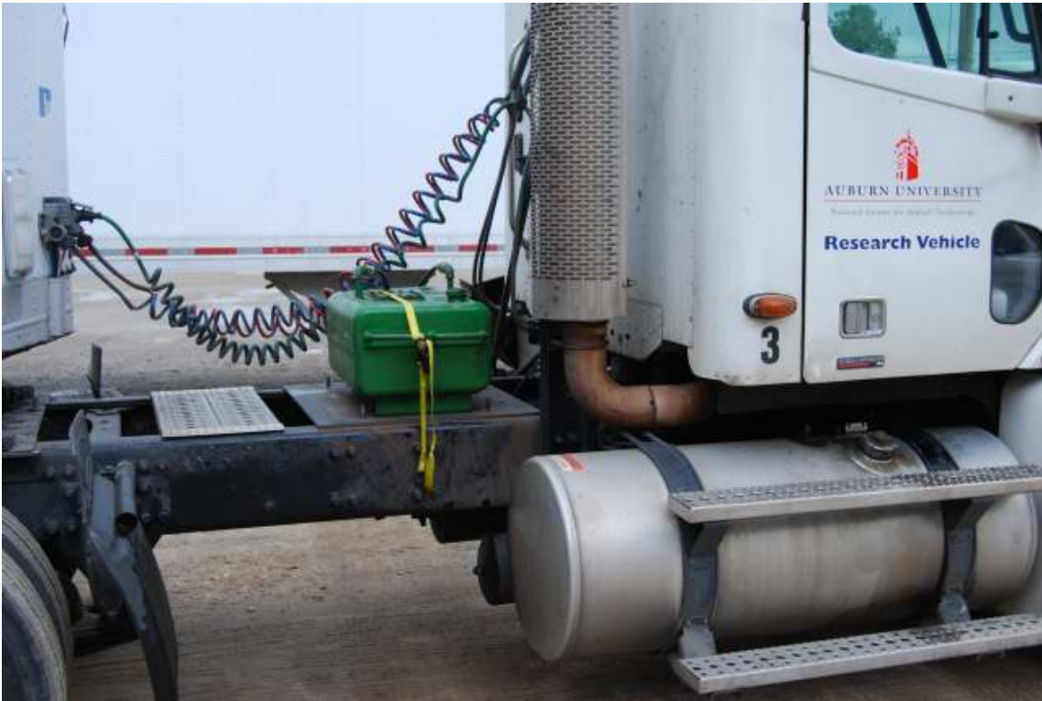
Figure 3 –Portable Weigh Tank

within the prescribed 2 percent filtering band were used to compute an average value representing each segment of testing.